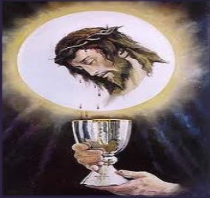
Most Holy Body and Blood of Christ

Most Holy Body and Blood of Christ Lord Jesus Christ, we worship you living among us in the sacrament of your body and blood. May we offer to our Father in heaven a solemn pledge of undivided love. May we offer to our brothers and sisters a life poured out in loving service of that kingdom where you live with the Father and the Holy Spirit, one God, for ever and ever. Amen