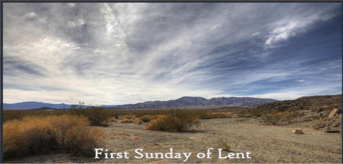
First Sunday of Lent